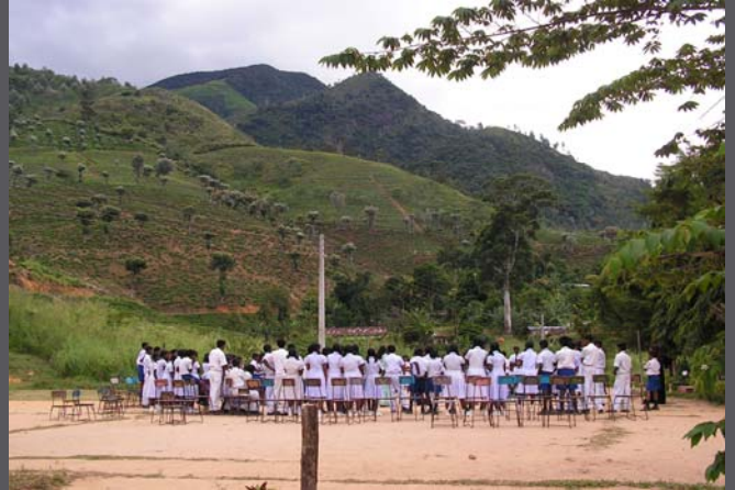
A rural school in Sri Lanka in an area difficult to access

His mother was previously a worker in the estate but accidentally broke her leg, had to undergo an operation and has been homebound for some time. He has an older bother and a younger brother studying for O levels. The older brother is now working in Colombo in a shop for 3000/- and cannot send any money home.