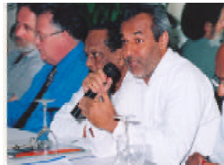
Hon Rauf Hakeem