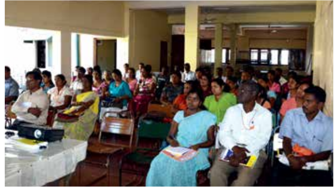
An information session regarding languages and the law, was held on the 7th of February, in the afternoon, at the Kandy City Mission hall at Kandy, with languages society officials.