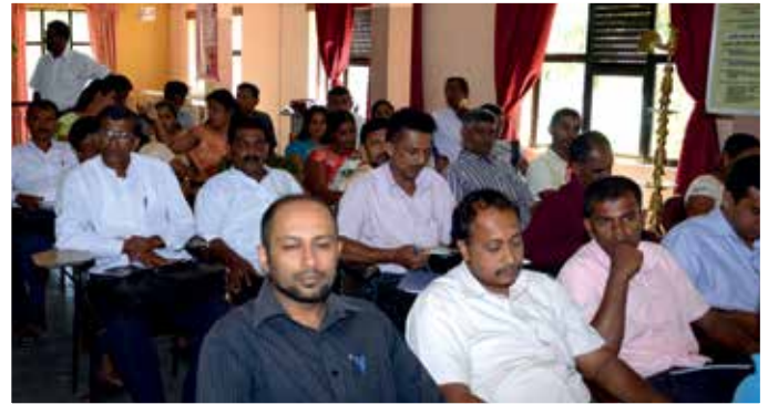
The programme that had been held on February 6th at the Matale Divisional Secretariat for government officials and language Society officials.