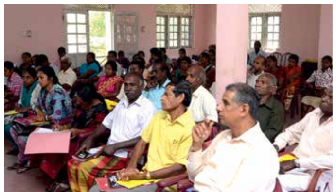
The languages training workshop that was held on the 8th February at the auditorium of the Passara Pradeshiya Secretariat for government officials and languages society officials.