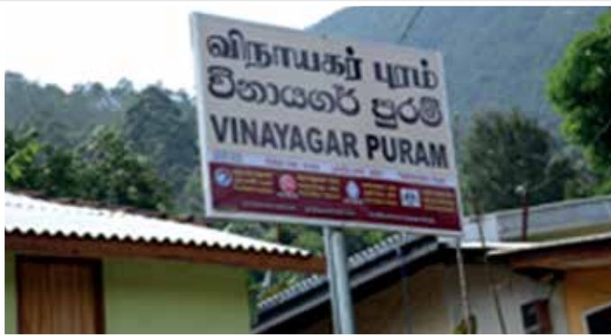
After erecting the Vinayagar Puram Signboard

Following are the photographs from the Vibhasha camera lens, showing the implementation of a programme safeguarding civil rights, that was held in the Passara region in order to provide permanent address to the families of estate workers.