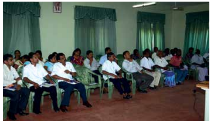
The programme that was held on 6th February at the Raththota DS, for government officials.