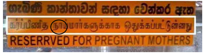
Showing how state buses have used the Tamil Language incorrectly

The Daily Mirror newspaper had stated on the 7th February 2014 that the BBC had stated that the Minister had said a mistake like this had occurred in the parliament too. But that it had been rectified.