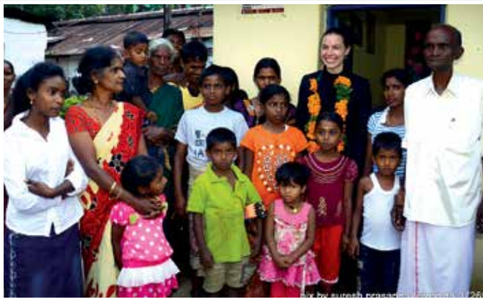
Some of the local recipients of unique addresses being visited by representatives of the High Commission