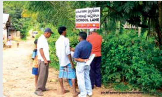
Trilingual sign boards set up in the region, during the “Vilaasam” programme. This programme safeguarding the civil rights of Estate workers, also provided addresses for around 3000 estate sector workers who did not have individual home addresses.