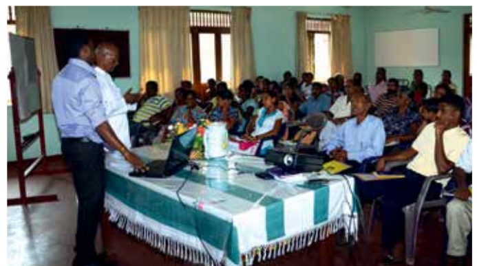
The language rights training programme that was held on the 8th of February at the Monaragala Sanasa Development auditorium for government officials and language Society officials.