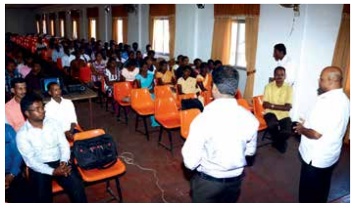
The training programme that was held on the 7th of February in the Hatton (Dikoya) region for government officials.