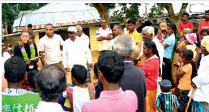
An exchange of ideas, among beneficiaries of the "Vilaasama" programmes.