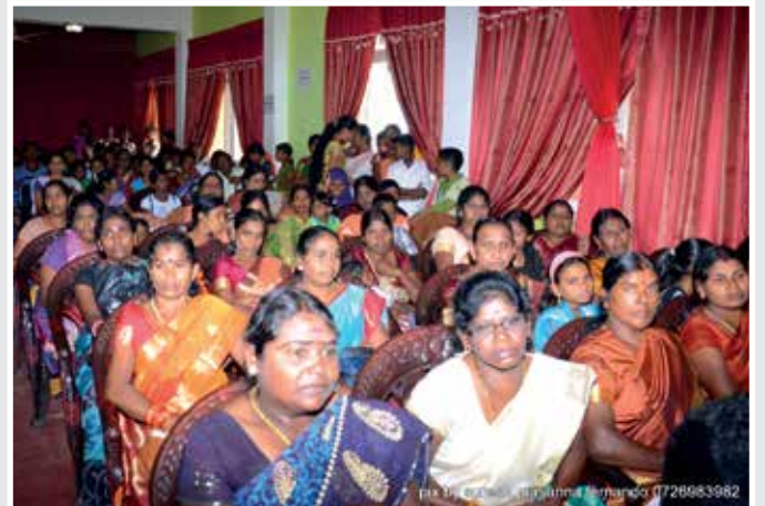
A public meeting as part of the Vilaasama Project