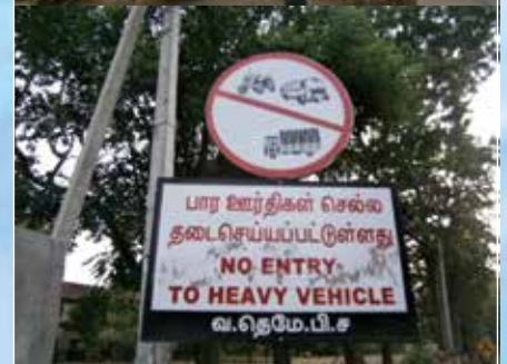
No entry to heavy vehicle Valigamam Pradeshiya Sabha (Only in Tamil and English)