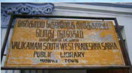
Public Library of the Valikamam South West Pradeshiya Sabha