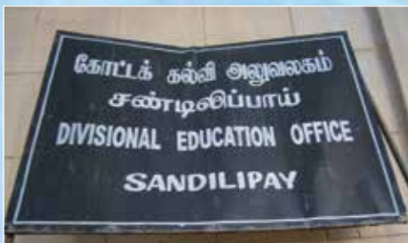
Divisional Educational Office Sandilipay