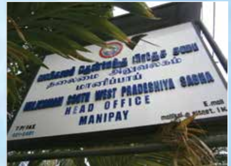
Valigamam South West Pradeshiya Sabha Head Office – Manipay