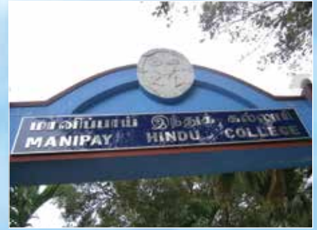
Hindu College Manipay