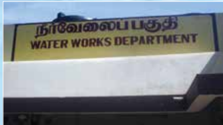
Water Works Department