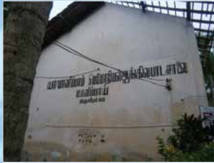
Manipay memorial English College Manipay (In Tamil Only)

We eagerly await changes occurring in Jaffna too, exhibiting language equality.