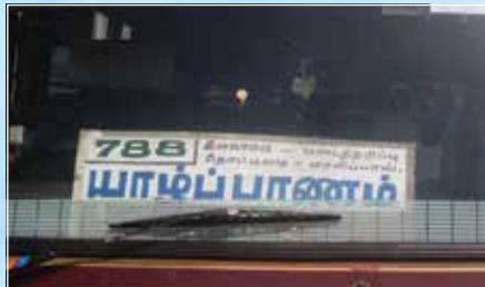
Transport Services (Only in Tamil)