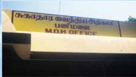
M O H Office