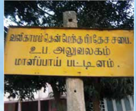
Valigamam South West Pradeshiya Sabha Sub Office – Manipay Pattinum