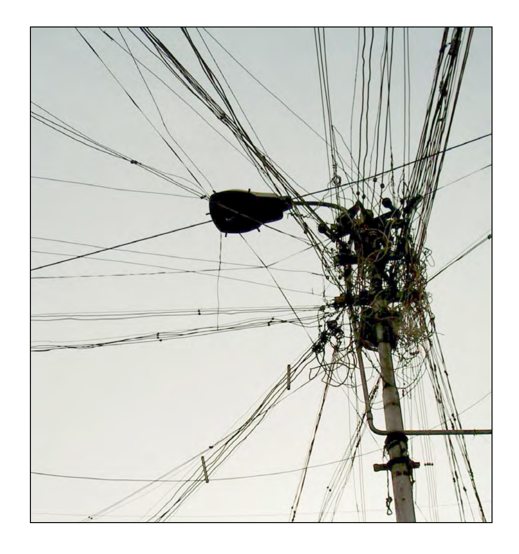
An Investigation into the Closure of CBNSat and Implications for Sri Lankan Broadcast Media